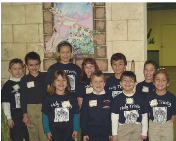
WFMJ Pizza Hut Luncheon at Children's Museum of the Valley